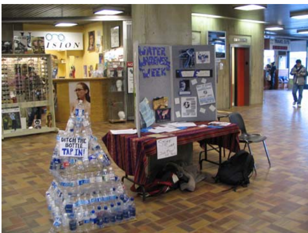
Tower of consumption built by Oxfam Guelph and the Guelph Students for Environmental Change, both groups participated in the day of action during their Water Awareness Week