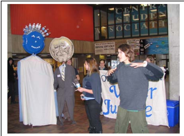
Oxfam Guelph performs street theatre involving the marriage of the bottled water industry to Harper in order to convey their message for the need to create a national water policy